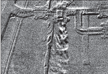
See even more with High-Contrast mode